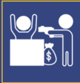
ROBBERIES, SHOP-LIFTING, RELATED CRIMES